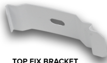
TOP FIX BRACKET

If you have ordered an Open Cassette Pelmet and wish to fit it with top fixing brackets - simply attach the top fix brackets using appropriate wall plugs and screws then hook the front part of the headrail under the front of the bracket and then gently push on the back of the headrail to secure it in place within the bracket.