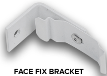
FACE FIX BRACKET

If you have ordered an Open Cassette Pelmet and wish to fit it with face fixing brackets - simply attach the face fix brackets to the wall using appropriate wall plugs and screws then hook the front part of the headrail under the front of the bracket and then gently push on the back of the headrail to secure it in place within the bracket.