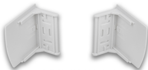
FACE FIX BRACKET

If you have ordered a Matching Fabric Pelmet and wish to fit it with face fix brackets - simply attach the face fix brackets to the wall using appropriate screw holes and wall plugs, then gently guide the ends of the headrail into the grooves on the bracket. We will supply you with a middle bracket for extra strength if your blind is over a certain length.